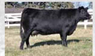
GR 8A-Maternal sister

Sire: VISIONTOPLINE ROYAL STOCKMAN VISION UNANIMOUS 1418 VISION EDELLA 665