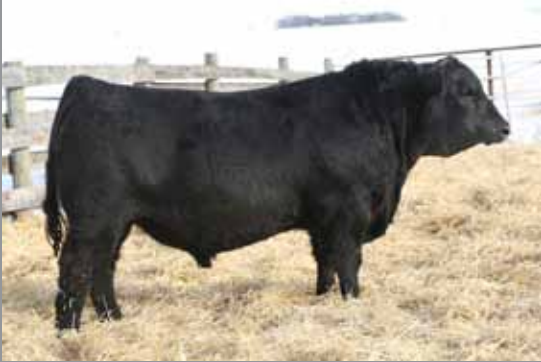
Remitall F Cavalry 180C- $14,000 to Otter Creek Farms ON, Southview Farms, ON