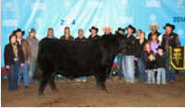
Farm Fair Grand Champion Angus Bull