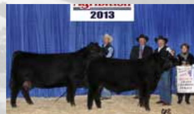
Dam with Rage