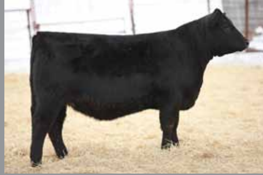
Remitall F Tibbie 139C- to Otter Creek Farms, ON and Southview Farms, ON

EPD: Expected Progeny Differences (EPD's) are used to compare the genetic merit of animals in various traits. An EPD predicts the difference in performance of future offspring of a parent, as compared to progeny from other parents.