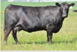
234S - Grand Dam