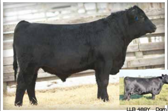
LLB 489Y - Dam