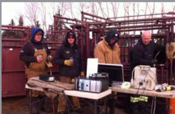
Ultrasounding Bulls and Heifers for 2016 Bull Sale