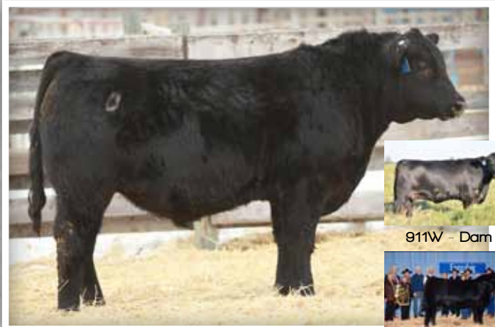
21R - Sire