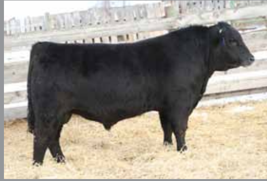
Remitall F Cavalier 67C- $25,000 to Triple J Farms