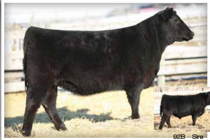
92B - Sire