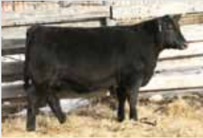
45B - Dam