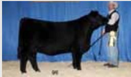
60Y - Dam