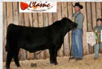
Olds Fall Classic Jackpot Champion Bull