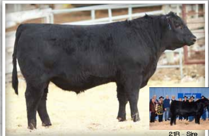
21R - Sire