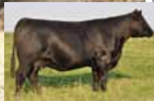
52Y - Dam