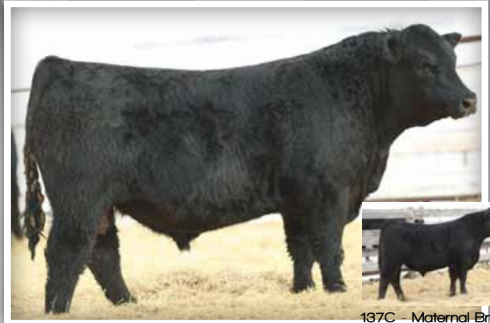
137C - Maternal Brother