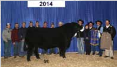
Canadian National Bull Champion 2014 CWA