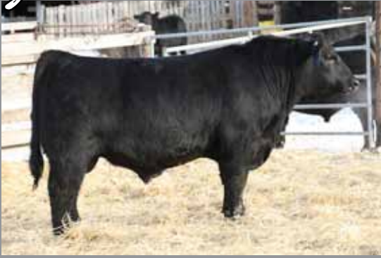
Remitall F Canyon 7C- $15,000 to Clint and Anna Collins