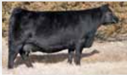
100T - Granddam