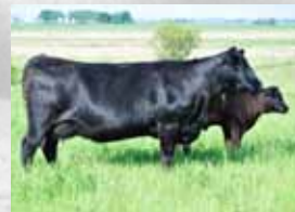
Ellen 73T Pictured as a 2 year old. Donor Cow and Granddam of Lot 64D