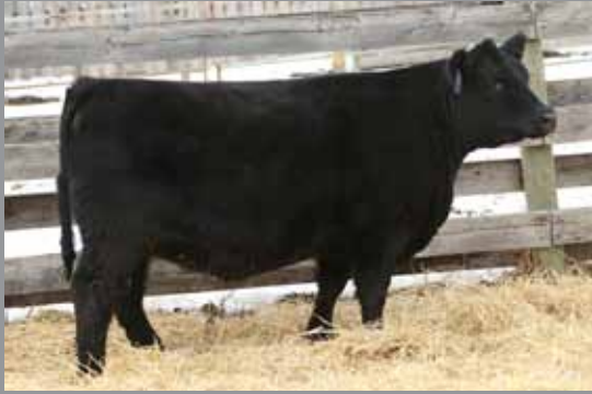
Remitall F Karama 3C- $13,000 to Remington Land and Cattle