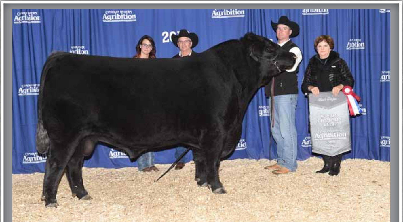
Remitall F Boycott 71B- 2016 Agribition Sr. Champion Bull Owned By Wiwa Creek Angus and Remitall Farms

RITO 707 OF IDEAL 3407 7075 BR POLLY 8077-472 SAV FINAL ANSWER 0035 BROOKMORE KARAMA 100T CUDLOBEYELLOWSTONE 80M ANGUS GLEN FAVORITE 9N SAV NET WORTH 4200 BROOKMORE BEAUTY 43M