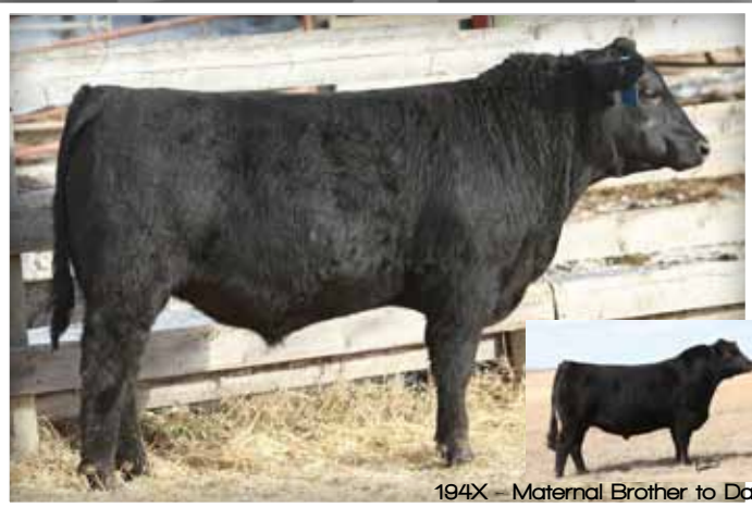
194X - Maternal Brother to Dam