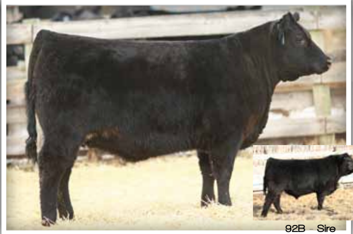
92B - Sire