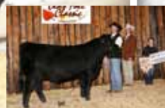
51C - Maternal Sister