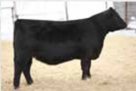
Remitall F Tibbie 139C-High Selling Female 2016 Sale-Maternal sister