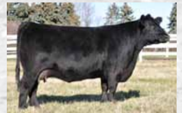
115B - Dam