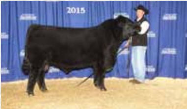
Remitall F Boycott 71B Prospector son

Remitall F Prospector 110Z has captured the attention of many top cattlemen and Angus breeders over the last couple years. Prospector was named Farm Fair Grand Champion Angus Bull, Canadian National Champion Bull at the 2014 Canadian Western Agribition and also reigned Supreme Champion Bull over all other breeds at both Farm Fair International and Agribition.