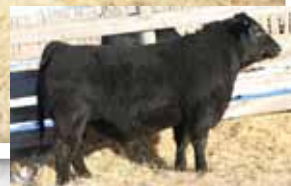
88C - Maternal brother