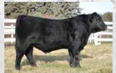
Lot 35D September picture