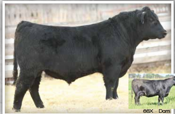
68X - Dam