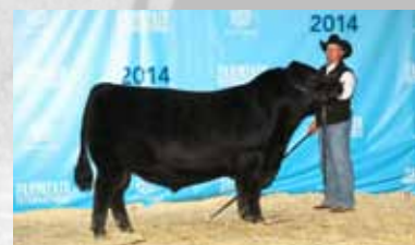
Remitall F Rage 9A - Farm Fair Sr Yearling Champion Bull

Remitall F Rage 9A is truly a remarkable individual. He is a real breeding bull who will make a lasting contribution. Rage 9A has the natural fleshing ability with thickness, muscle expression, masculinity, superb structure and authentic Angus breed character. A real carcass oriented muscle pattern with an actual 18.9 /sq inch rib eye at 12 months of age. A true beef bull that excels in adding appetite and gainability resulting in more pounds.