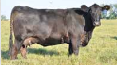
Dam of Prospector