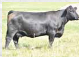
67U - Grand Dam