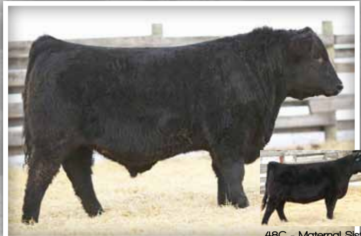
48C - Maternal Sister