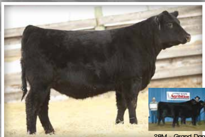
28M - Grand Dam