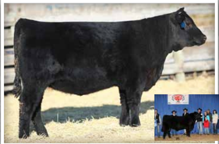
Remitall F Boycott 71B National Champion Bull - Sire