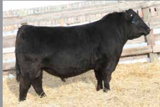
Remitall F Crossfire 102C- $34,000 to Bandura Ranches