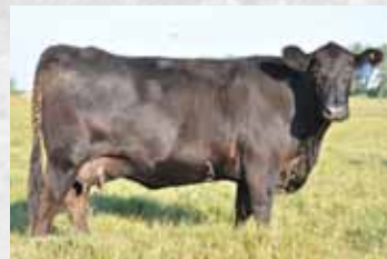
Remitall Ellegra 719U -GrandDam and Dam of Remitall F Prospector 110Z