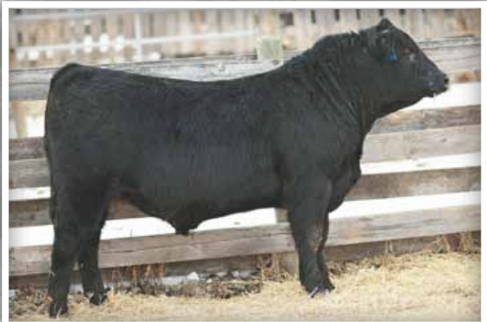
911W - Dam