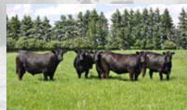
Rage with heifers