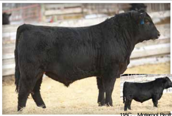
118C - Maternal Brother