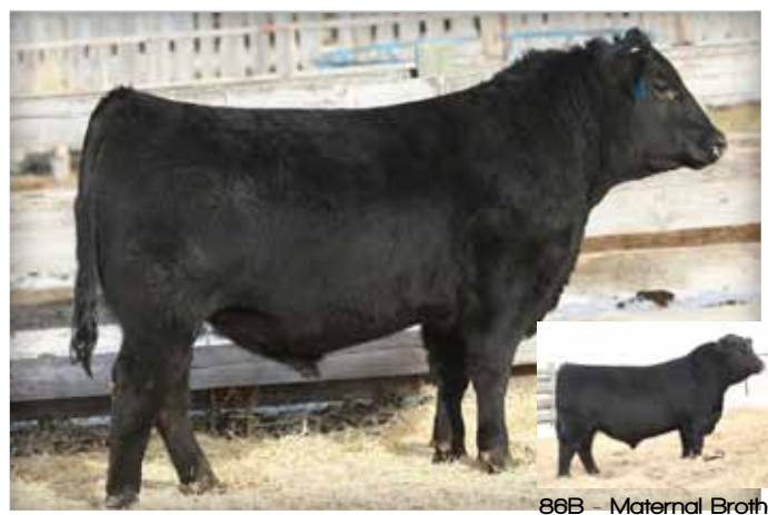
86B - Maternal Brother