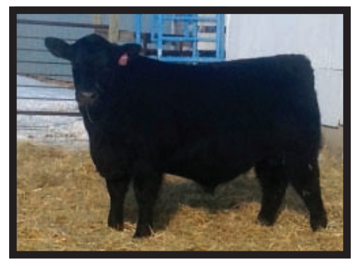
FULL BROTHER LOT 13

IDEAL 7451 OF 8103 4465 AMF CAF NHF DDF RAINBOW HILLS 7451 211M RAINBOW HILLS LADY BATE 205J Dam: MEADOW PRIDE 9R (1275325) PAPA UNIVERSE 515 AMF NHF HAPPYVALE PRIDE 38J BIEVER'S EXT PRIDE 30E