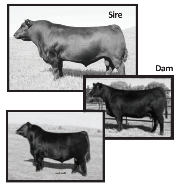
Full brother to PDAR 937X